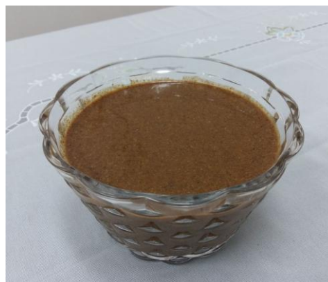
Fig. 2: Final product sample of mahyaveh produced in this study