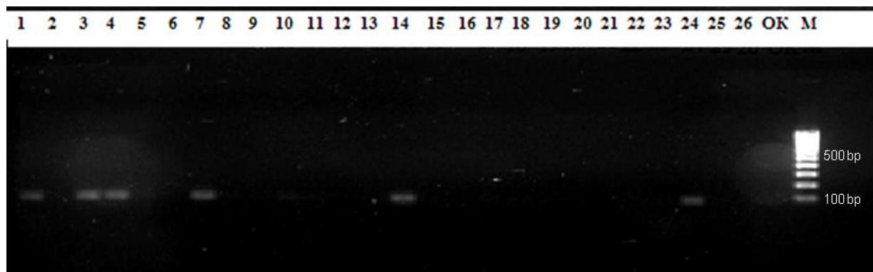
Fig. 2: PCR amplifications of Brucella spp. isolates with Bm and Bm-r primers. Positive results including lane 1: B. melitensis 16 M; lane 3: B. melitensis 565; lane 4: B. melitensis H-12; lane 7: B. ovis 8; lane 14: 0041; lane 24: 0055. Negative results including lane 2: B. abortus 544; lane 5: B. abortus 100; lane 6: B. abortus 960; lane 10: S. abortus-egui E841; lane 11: E. coli ATCC 25922; lane 12: B. abortus 19; lane 13: B. ovis 63/280; lane 14: 0041; lane 15: 00134; lane 16: E. coli 0-15; lane 17: P. multocida bovis 216; lane 18: 00192; lane 19: 0044; lane 20: 0013; lane 21: 0011; lane 22: B. suis 1330; lane 23: 0037; lane 25: S. typhimurium 371; lane 26: S. enteritidis . Lane OK: negative control; lane M: 100 bp GeneRuler DNA ladder